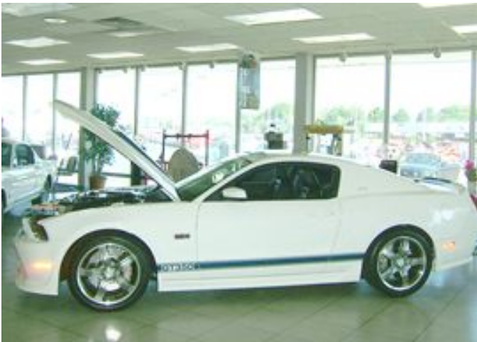
Shelbys from now and then graced the showroom