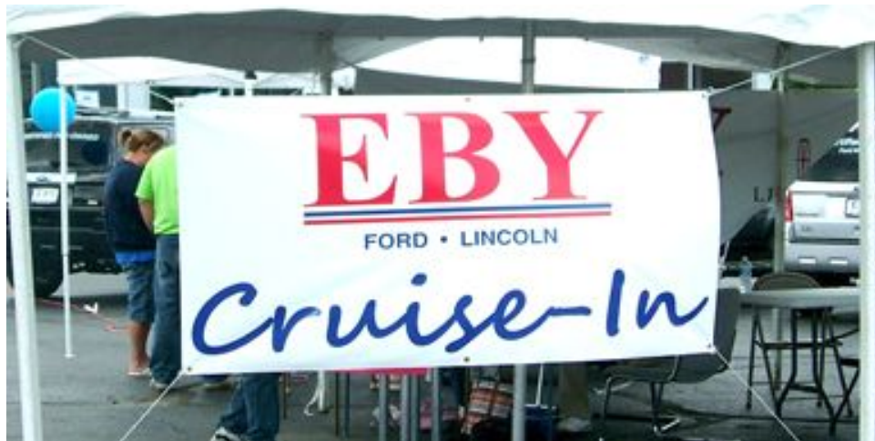
Cruise-In season comes to Michiana; see pages 6 and 7.