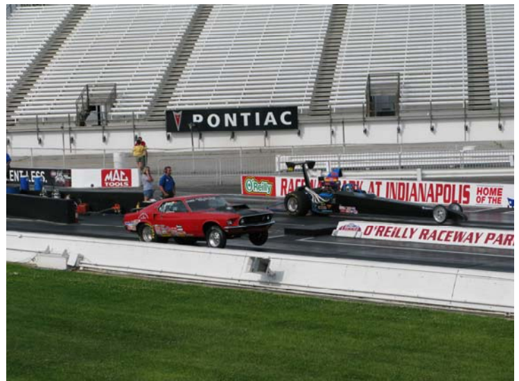
There was plenty of action on the track