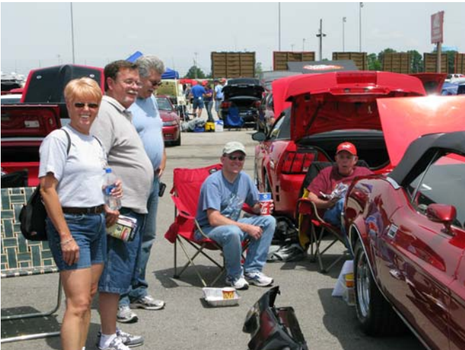
One of the best parts of a show is being able to visit with friends

All in all it was a great time with good friends and good-looking cars.