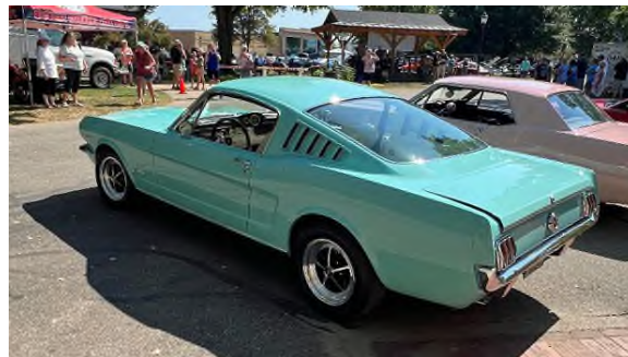
Best of Show winner

Scan the QR code below to go to our website or our Facebook page.