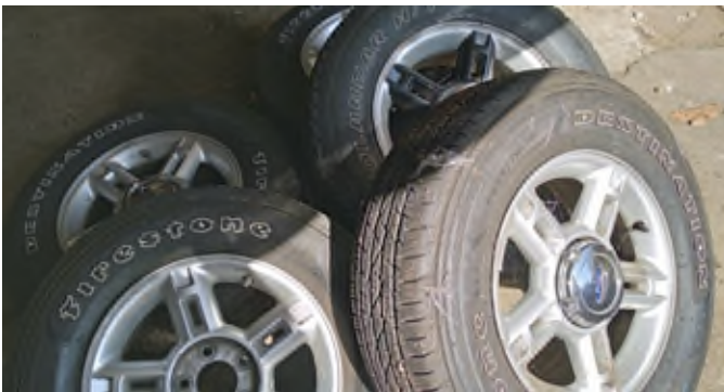
Ford Explorer rims with tires for sale. Tire size is P235/70/R15. Set of five with good tires. Asking $500 for the set of five.

I will CONSIDER (not necessarily accept) best offer. Contact Harold Jedrzejewski at 574-315-0589.