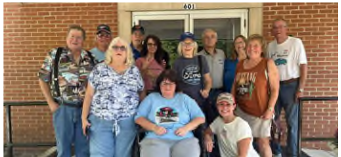
Those of us that stayed to go back into town after the parade.

I don't mean to brag, but cashiers are always checking me out.