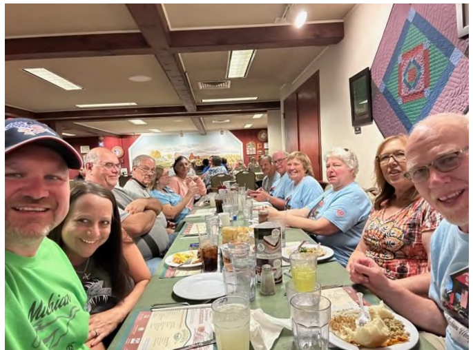
Of course, we could not finish the day without visiting the restaurant for dinner!