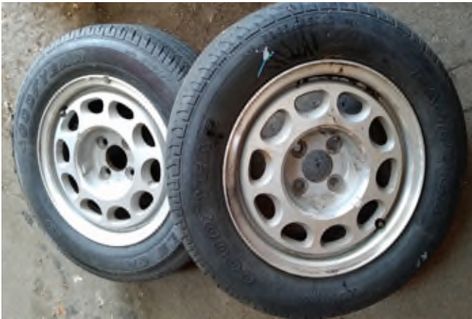
Rims with tires for sale. (4) 10-hole Fox Mustang rims (top) For P205/65/R15 tires. These tires are shot. Asking $200 for the set of four.