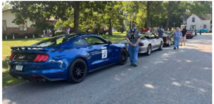
Getting to the staging point early allows for visiting before the parade.