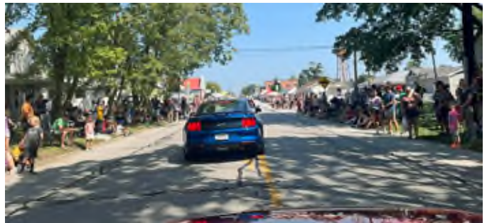
The crowds are always large for the PorkFest parade.