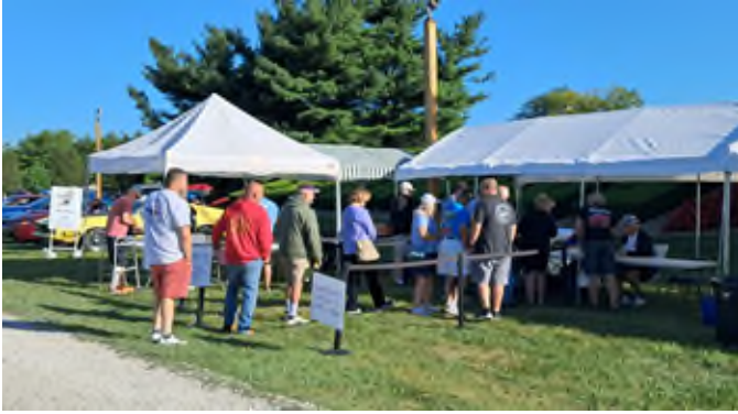
The Registration tent was busy all morning.