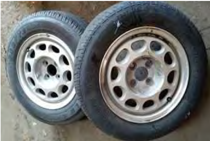
Rims with tires for sale. (4) 10-hole Fox Mustang rims (top) For P205/65/R15 tires. These tires are shot. Asking $200 for the set of four.