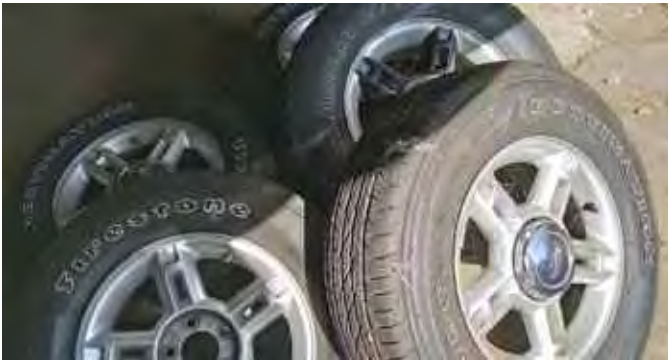
Ford Explorer rims with tires for sale. Tire size is P235/70/R15. Set of five with good tires. Asking $500 for the set of five.

I will CONSIDER (not necessarily accept) best offer. Contact Harold Jedrzejewski at 574-315-0589.