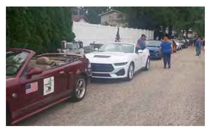
Early morning lineup in Osceola. We were able to do at least one set of red, white, ands blue Mustangs in all the parades.

Michiana Mustang members braved the cold, rainy weather to participate in three parades on Memorial Day.