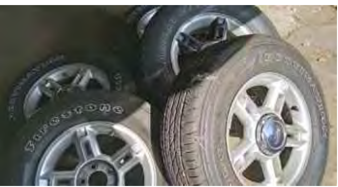
Ford Explorer rims with tires for sale. Tire size is P235/70/R15. Set of five with good tires. Asking $500 for the set of five.

I will CONSIDER (not necessarily accept) best offer. Contact Harold Jedrzejewski at 574-315-0589.