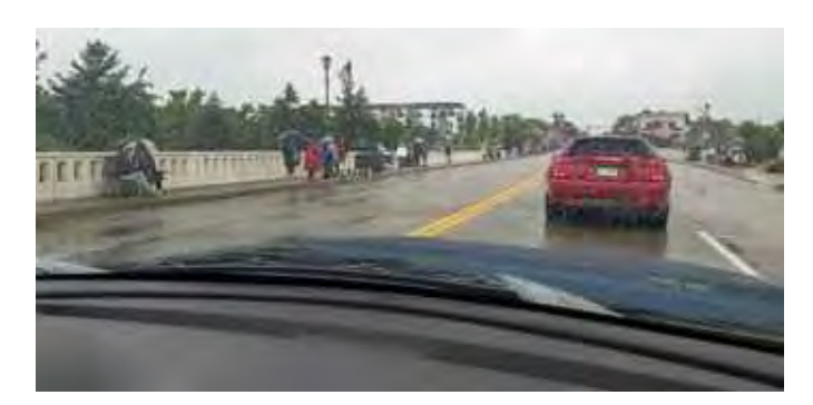
The weather certainly could have been better, but we had very good turnouts for the parades

Thanks, Brad for the pictures and stories!