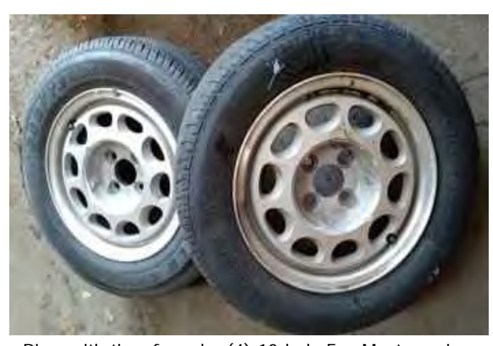
Rims with tires for sale. (4) 10-hole Fox Mustang rims (top) For P205/65/R15 tires. These tires are shot. Asking $200 for the set of four.